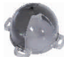
3 Way dome

Only 90° segment is transparent rest all 270° is black